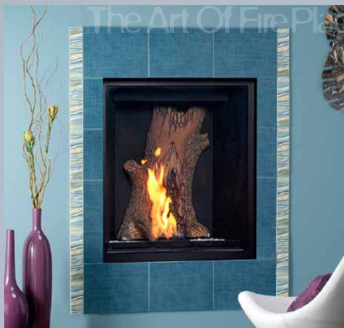
model T34DF shown with optional Designer LogSet.