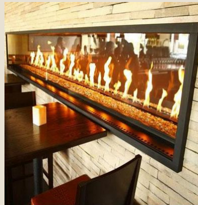
See Through Model