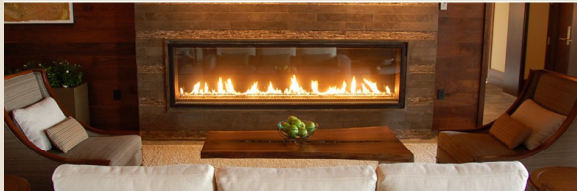
Single Sided Model

Don't let the size and shape of your fireplace be decided for you. Montigo offers the largest selection of sizes and configurations available!