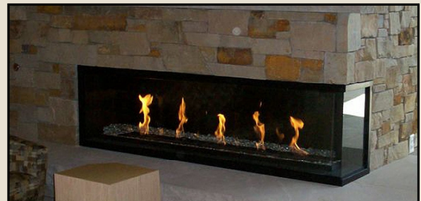
Corner Right Model