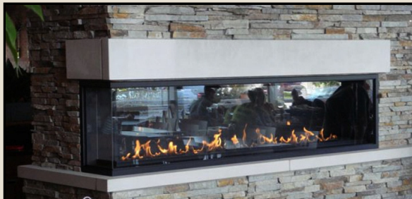
Corner Left Model