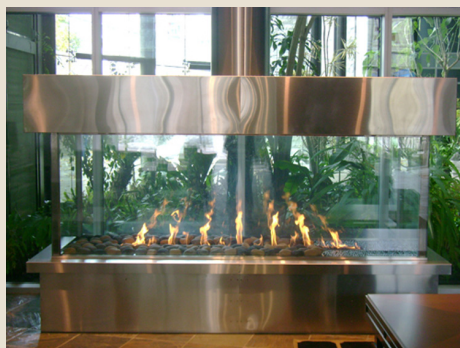
4 Sided Model